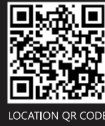
LOCATION QR CODE